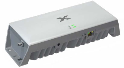
CEL-FI GO G41

Combining unmatched performance with ease of installation, CEL-FI GO G41 is a single-operator cellular signal booster that delivers reliable in-building 4G and 5G connectivity for “small box” retail stores, branch offices, and homes. In addition to featuring the latest Nextivity proprietary 4th generation IntelliBoost technology, which delivers channelized signal boosting and industry-leading signal gain up to 100 dB, GO G41 can be installed in as little as one day and can be monitored and managed remotely via the Nextivity WAVE Portal. GO G41 also gives you the flexibility to select and switch which MNO signal to boost via the Nextivity WAVE App.